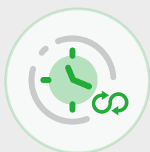
Long Cycle Life