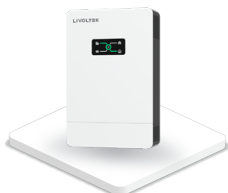
Off-grid Hybrid Inverter