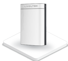
Residential Lithium Battery