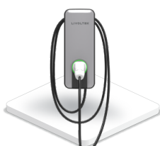
Smart EV Charger